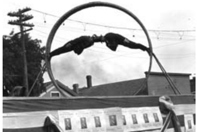
Belle Plaine Herald June 6, 1900

...In the evening Prof. Torley gave a good exhibition of fancy cycle riding, the scene being lighted up by Greek fire, gas jets, torches and lanterns, following which event the lantern parade and drill of the cyclists was given. ...The slack wire exhibition given on Bridge square today was very clever, and Willard brothers restored themselves to favor in the eyes of the public and the fair managers.