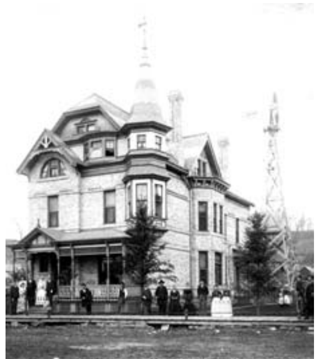
The Nicolin mansion in Jordan.

Did you answer all the questions? Turn the page upside-down for the answers.