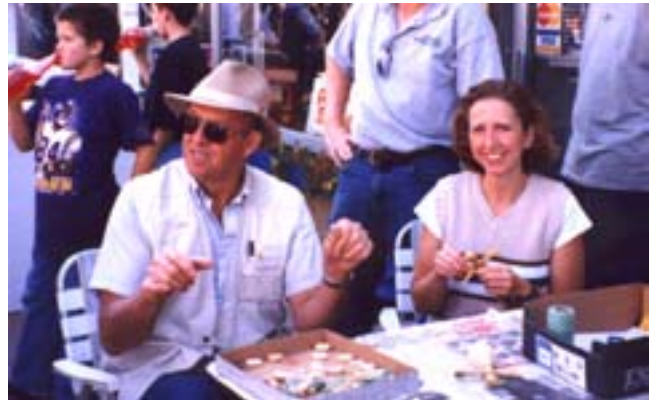
SCHS volunteers making old fashioned toys at Dozinky Day.