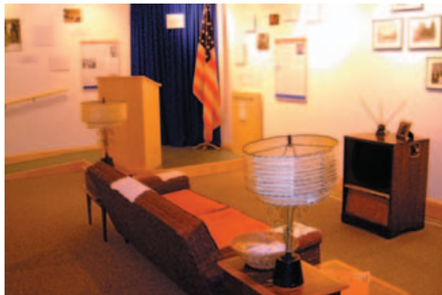
Rhetoric - Podium & speeches 1950s Living room - early TV campaign ads