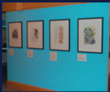
Saint John's Bible Print Exhibit