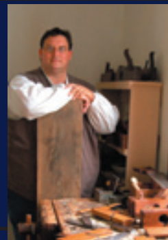
Traditional Woodworking Workshop