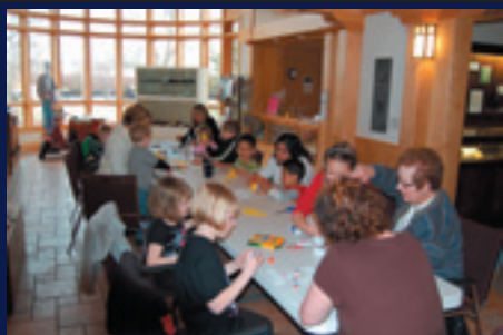
Kids Kraft - hands-on Family Fun!